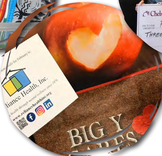
Big Y Giving Tag Program