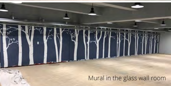
Mural in the glass wall room