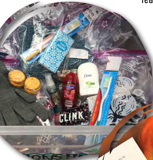
Students at Moriarity Magnet Elementary provided care packages for those experiencing homelessness.