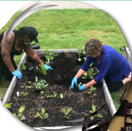
Another successful year of gardening at our Residential Programs thanks to the Eastern Connecticut Community Garden Association!