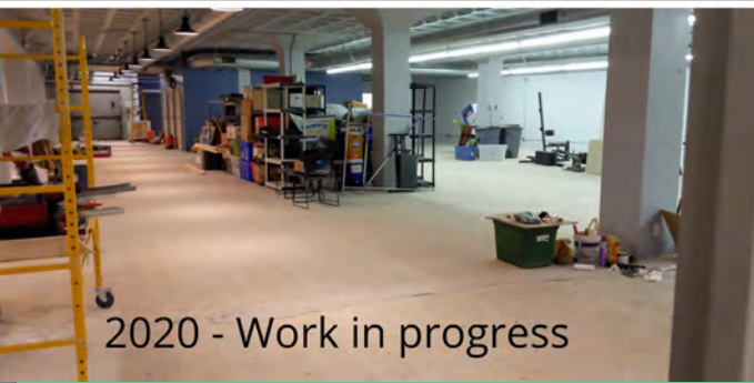
2020 - Work in progress