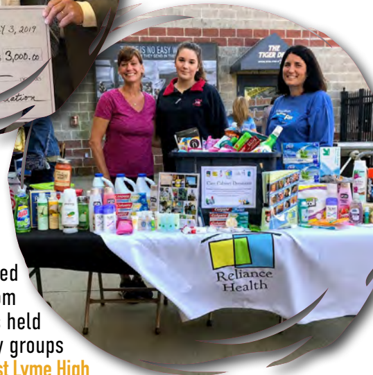
Our Care Cabinet received donations from several drives held by community groups including East Lyme High School, Hartford Healthcare Center in Norwichtown, and the Greater Norwich Area Chamber of Commerce.