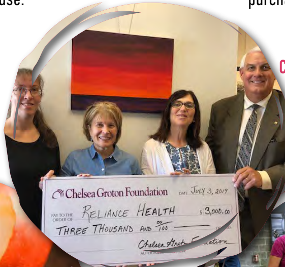
Chelsea Groton Foundation provided funds for outings and care packages for program participants.